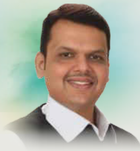
Shri Devendra Fadnavis

Hon'ble Union Minister for Road Transport & Highways, Chief Patron, Agrovision