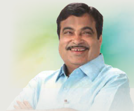
Shri Nitin Gadkari

Agrovision, the illustrious 4-day annual event is held in Nagpur, stands out as an exceptional platform for farmers from across India to exchange knowledge and expertise. Pioneered 13 years ago under the distinguished leadership of Chief Patron Shri Nitin Gadkari, Hon'ble Union Minister for Road Transport & Highway, Agrovision has continuously elevated its significance and influence with every subsequent edition. This momentous movement aspires to educate, encourage, and empower farmers by introducing them to cutting-edge farming technologies and allied agribusinesses that amplify their income and ensure a sustainable livelihood. Its unparalleled success and significance make it the most highly anticipated agri-festival in central India, attended by the cream of the agricultural community.