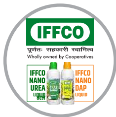
IFFCO Wholly Owned by Co-operatives