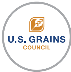
U.S. Grains Council U.S.A.