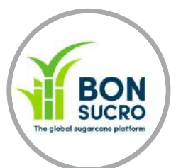
Bonsucro The Global Sugarcane Platform, London, UK