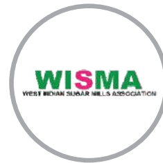
WISMA West Indian Sugar Mills Association